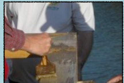
Access to the fishing pier will hold for the 2012 season!