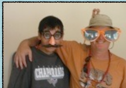
Karaoke! Heat and fire dangers yielded to new activities in September.