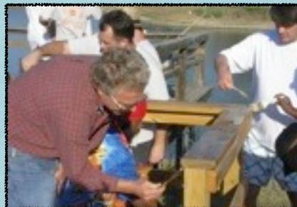
Painting, treating, and caring for the wood. Eager helping hands!