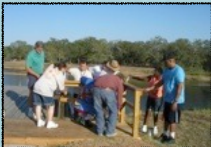
Wheel chair ramp is chosen by the campers as the "Giving Back" Project in September .