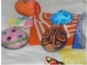
There's Fishing and then there's using clay to express your experience!